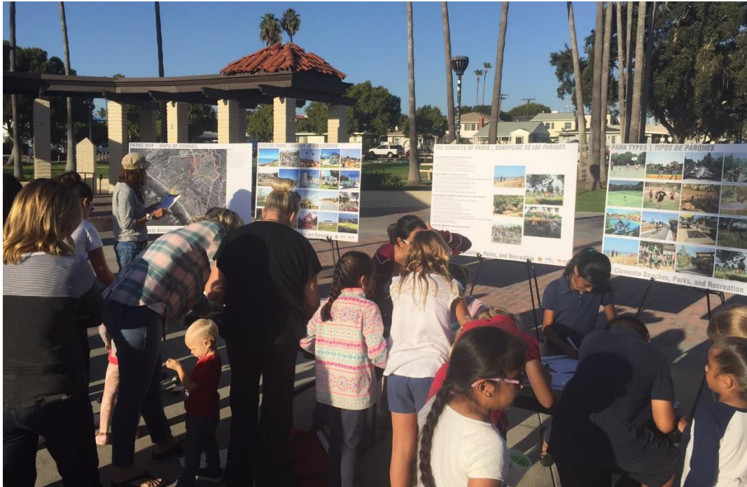
Community members write and draw their park goals at Max Berg Plaza Park. November 17, 2016.

In addition to the in-person responses at the workshops, participants had the opportunity to fill out a questionnaire. All questionnaires are attached in Appendix C.